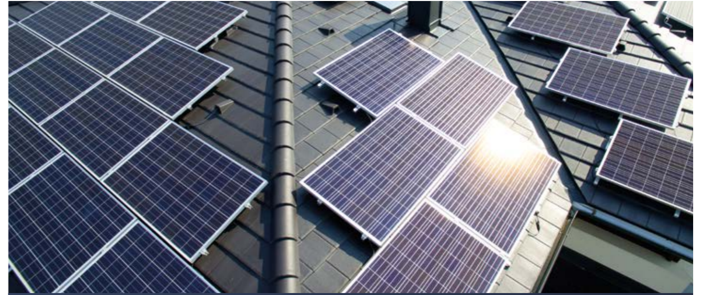
Large solar panels on top of the roof

Take advantage of our progressive and innovative solutions when building or renovating one of your greatest assets, your home.